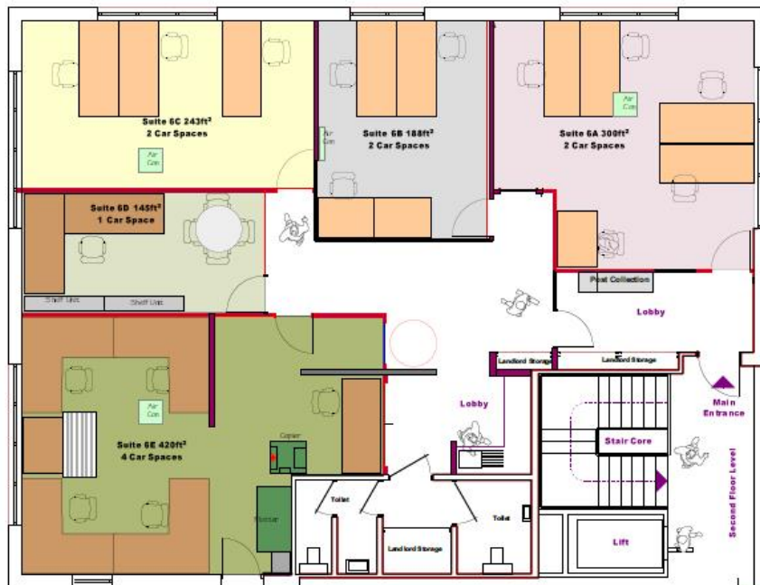
Suite Six Office Layout Arrangement

Air Conditioned Offices Car Parking Over Looking Medway River