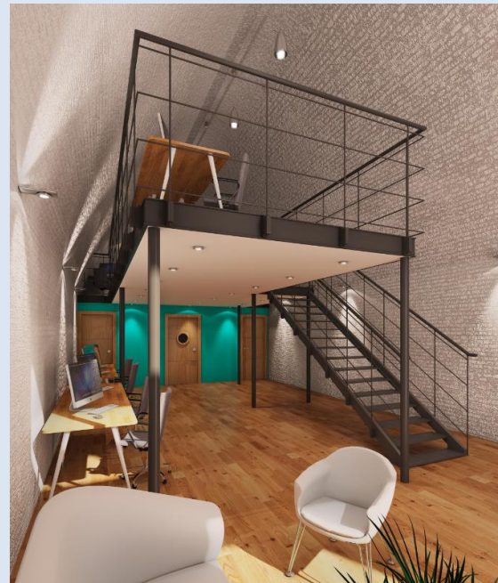
Computer generated images. For indicative purposes only.

There is a potential for a full mezzanine floor and pads have been laid in the underfloor heating to accommodate future construction.